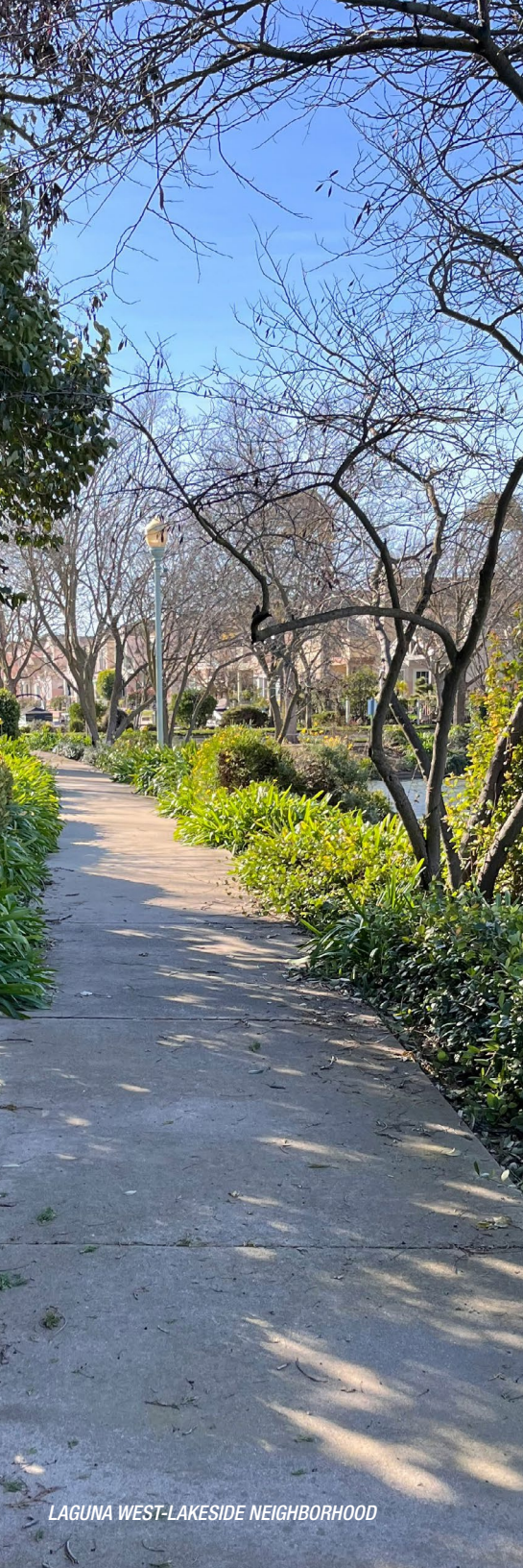
LAGUNA WEST-LAKESIDE NEIGHBORHOOD